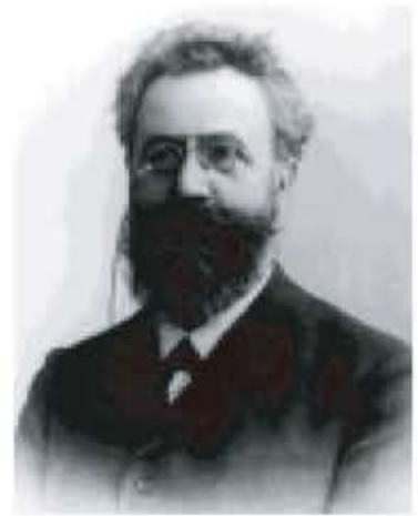
Hermann Ebbinghaus (1850~1909)

GST Language Center의 음성학적 영어 학습법은 교재를 크게 소리내어 읽는 방법으로 학생이 자신의 말로 직접 귀와 입을 훈련하면서 언어를 습득할 수 있는 방법입니다. 더욱이 GST Language Center에서는 이 방법에 Ebbinghaus의 기억력 주기 학습법을 접목하여, 학생이 이전 수업에 배운 내용을 완전히 잊기전에 또다시 반복과 복습을 통해 최단기의 영구적인 영어습득이 가능하도록 하는 프로그램으로 이루어져 있습니다.